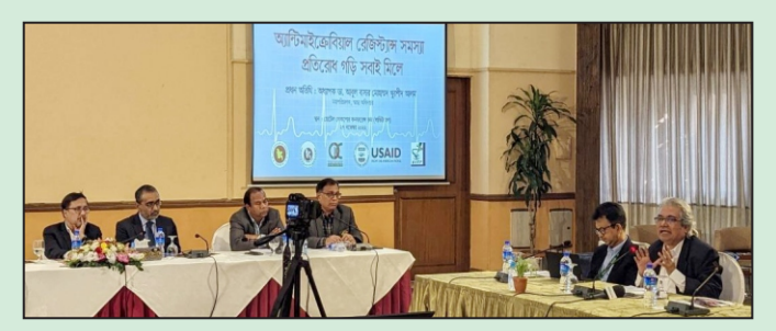
Round table discussion

Control (CDC) department, USAID Medicines, Technologies, and Pharmaceutical Services (MTaPS) and Bangladesh Health Reporters Forum jointly drew large coverage by the leading newspapers and electronic media.