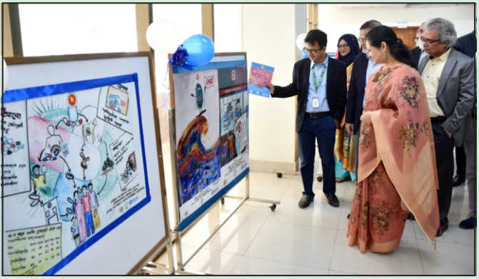
Opening session and visiting the Poster Presentation at IEDCR