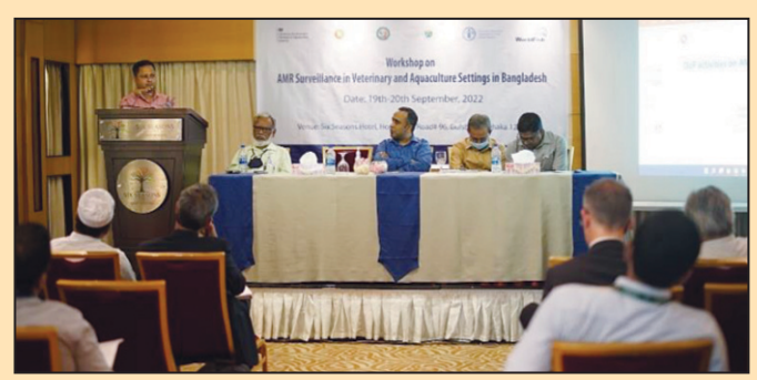
Experts sharing recent insights and achievements

Institute (BLRI) and Central Disease Investigation Laboratory (CDIL). Professors from Chattogram Veterinary and Animal Sciences University (CVASU) and Bangladesh Agricultural University (BAU) along with the members from Fleming Fund Country Grant to Bangladesh (FFCGB) and Fleming Fund Fellows attended the workshop. Members from International Center for Diarrheal Disease Research. Bangladesh (icddr,b), One Health and AMR experts from NPARKS, UK's FAO Reference Centre for AMR (Cefas and APHA), FAO-ECTAD and WorldFish also attended the workshop. A team of six visiting experts of UK's FAO Reference Centre for AMR facilitated the workshop. The workshop with the active participation of the relevant stakeholders, shared and reviewed recent insight and achievements, identified gaps of existing surveillance structures and policy frameworks and established a framework for future collaboration in strengthening AMR surveillance capacity in the animal health and aquaculture sectors in Bangladesh.