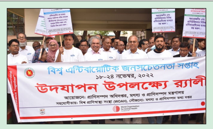
Participants in the Grand rally of DLS for celebrating the WAAW 2022: DG, DLS and the Team Lead, FFCGB among others are seen attending the rally