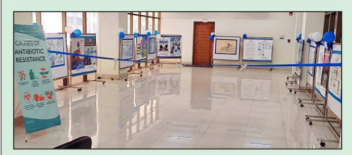
Poster Presentation at IEDCR

To mark the occasion, 'AMR poster presentation' was held and prizes were distributed to the winners of essay and poster competition on AMR organized among the students in different categories.