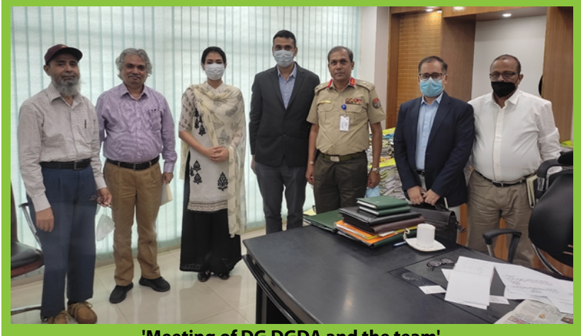
'Meeting of DG DGDA and the team'

One of the major partners in AMR containment is the Fleming Fund. Mott MacDonald is the management agent of Fleming Fund and its' regional team based in New Delhi, India, recently visited Bangladesh to oversee the progress till date in the areas of AMR surveillance and containment in the country. During their 10-day visit, the Mott team had extensive interactions with the relevant government stakeholders including CDC DGHS, DLS, and DGDA, the development partners including WHO, USAID, US CDC and FCDO Dhaka office. The team visited three national reference laboratories (IEDCR, CDIL and BLRI), and five sentinel sites (Chittagong Medical College, Dhaka Medical College, Mymensingh Medical College, Poultry Research& Training Centre (PRTC and Chattogram), and Quality Control Laboratory for Fisheries at Savar), and had effective interactions with different group of professionals like laboratory staff, the physicians and scientists, and the management staff. The team met the Fleming Fund Country Grant team, DAI, and its' consortium partners.