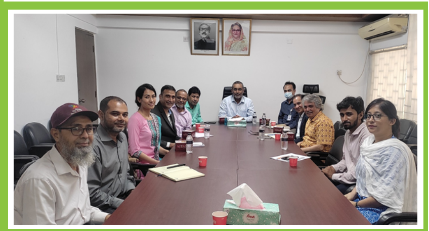
Meeting of director CDC DGHS and the team

The Communicable Disease Control department of the Directorate General of Health Services (CDC-DGHS) is the designated National AMR coordination centre of Bangladesh and is implementing the AMR Containment programme along with other departments including the Directorate of Livestock Services (DLS), Department of Fisheries (DoF), Directorate General of Drug Administration (DGDA), and the Department of Environment with a One-Health concept. Several developmental partner organizations like the Fleming Fund, USAID, WHO, World Bank, FAO and others are supporting the programme.